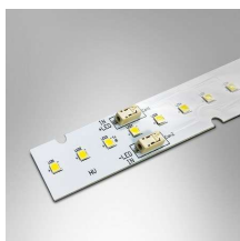
LED Strip Module