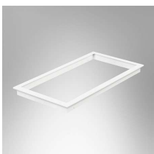
Concealed Ceiling Frame 300x600mm.