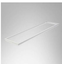
Concealed Ceiling Frame 300x1200mm.